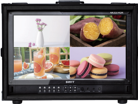
12G/6G/3G/HD-SDI & HDMI Mixed formats Quadview