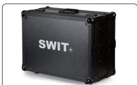
Go with Flight Case