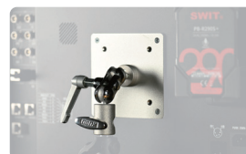
VESA to C-stand Adaptor