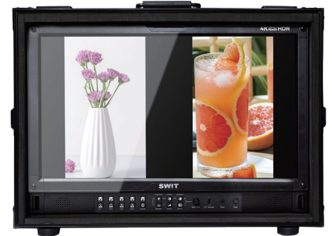
Any 2 inputs Vertical (Cropped) Pic-by-Pic display