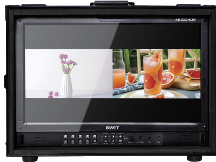
Any 2 inputs Pic-by-Pic or Pic-in-Pic display