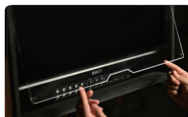
With Screen Protector